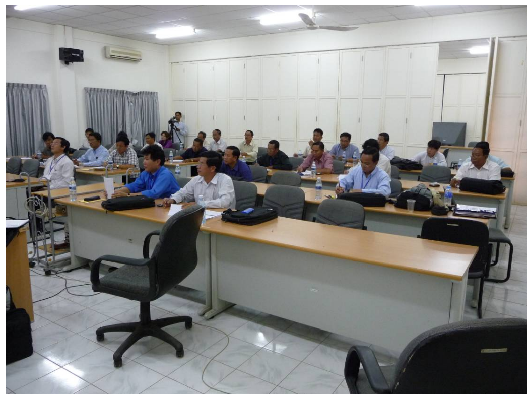
Students during the final comment and question period on second day.