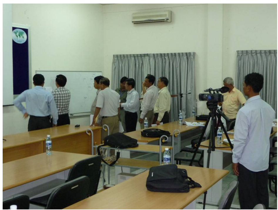
Students working on investigative flow charts following practical exercise on second day.

Each team then went and prepared a brief presentation for the whole class on their findings and recommendations. This included visual presentations utilizing a commodities flow chart and a link analysis chart showing the flow of illegal timber and the suspects involved.